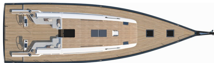
3 cabins 2 heads version: