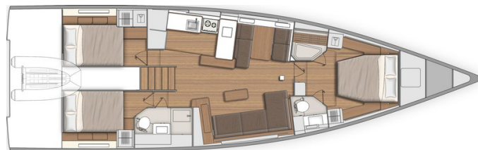
3 cabins 3 heads - Skipper's cabin version: