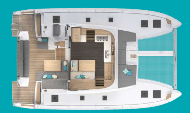
Salon - 6 place settings