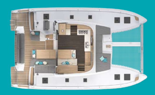
Salon - 12 place settings