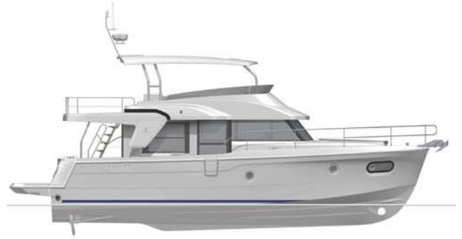
Profile - FLY