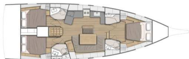
Lower deck / Bathrooms 3 cabins 3 version