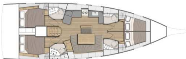
Lower deck / Bathrooms 4 cabins 4 version