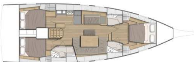
Lower deck / Bathrooms 3 cabins 2 version